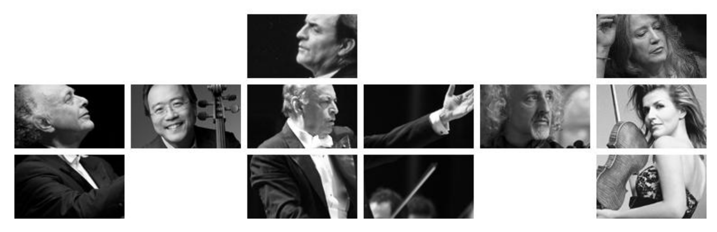
Creative Media for Artists, Audience and Sponsors